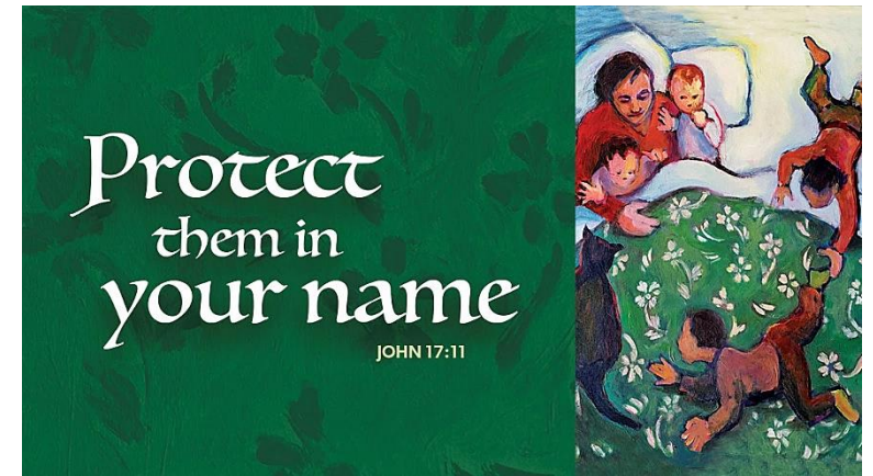
Six in Bed (2022) by Carol Aust. Copyright © Carol Aust. All rights reserved. Used by permission of the artist.